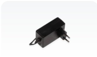
48 V 0.95 A power adapter