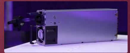
G1483-0600WNB, hot-swap 600 W power supply, available for purchase separately!

4K security cameras with built-in winter heating elements, LED ad screens, PoE-powered light fixtures – CRS320 can output up to 90W per port , enough even for the most demanding devices! It comes with a reliable 600 W power supply, but we've reserved an expansion slot for an additional PSU, in case you need to raise the power output to 1150 W.