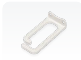
Cable management bracket