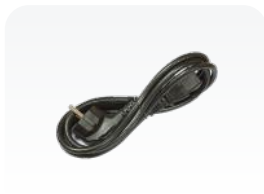
2 Power cords