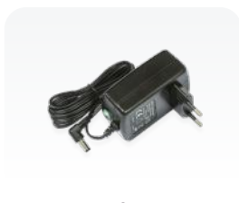
48 V 1.35 A power adapter