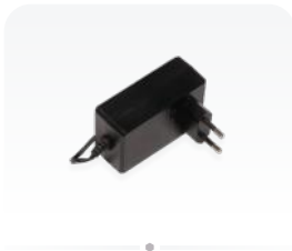
48 V 0.95 A power adapter