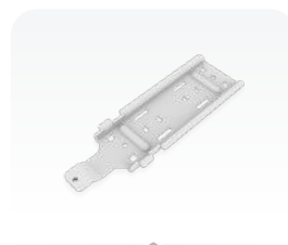
Outdoor case bracket