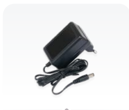
24 V 0.8 A power adapter