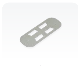
Ceiling mount base